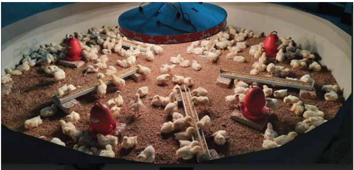
Poultry Shed for research at BIRTAN head office