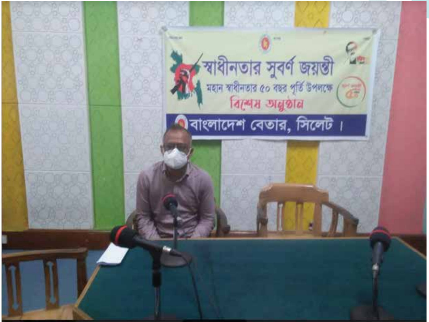
Presenting Radio talks at Bangladesh Betar, Sylhet Station by BIRTAN's official.