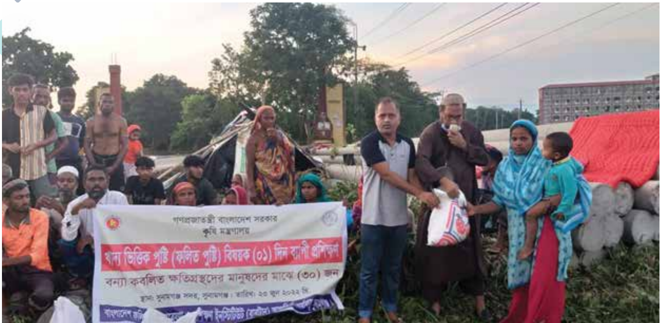
BIRTAN provided applied nutrition training and food items to the flood affected people of Sunamganj